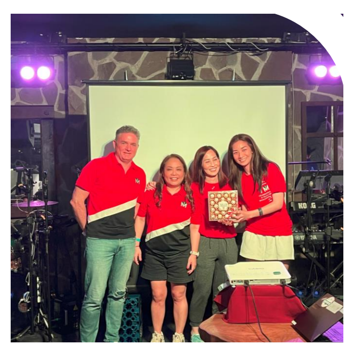
Award Presentation & Closing Appx. 15 – 20 mins