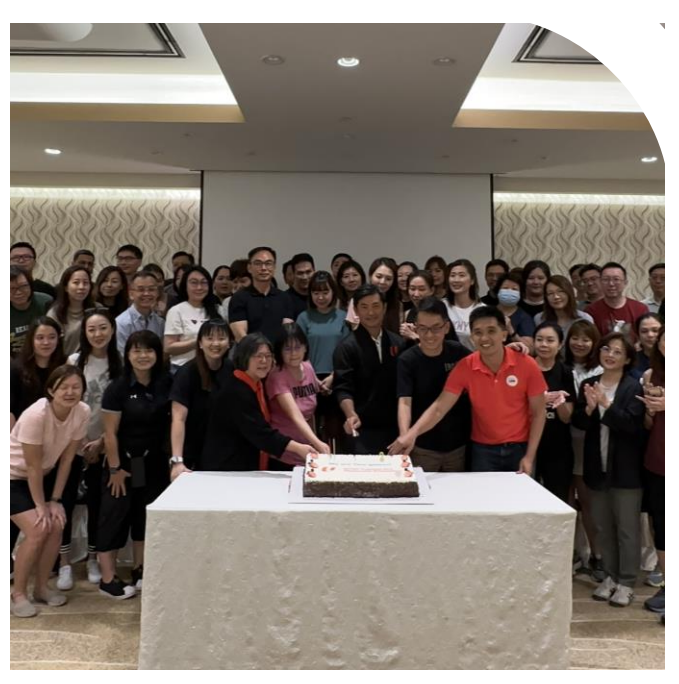
Award Presentation & Closing Appx. 15 – 20 mins