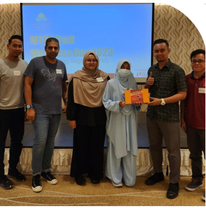
Award Presentation & Closing Appx. 15 – 20 mins