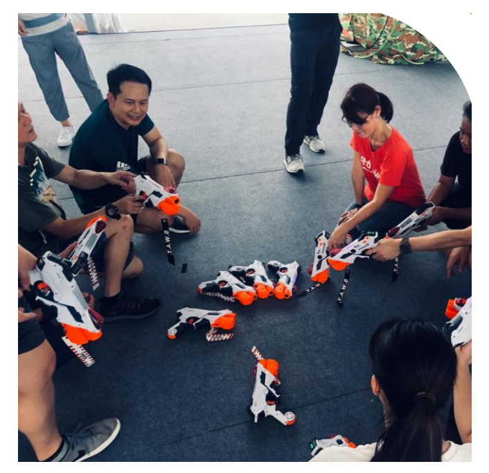
Demonstration & Tryouts Appx. 15 -20mins