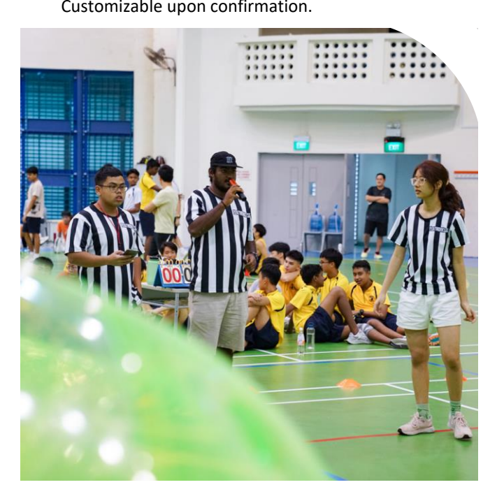
Safety Briefing & Warm-Up Appx. 15 - 20mins