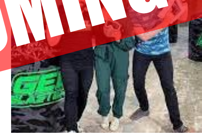
Safety Briefing & Warm-Up Appx. 15 - 20mins

Demonstration & Tryouts Appx. 15 -20mins