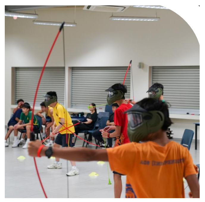
Actual PLAY Time Appx. 60 120mins