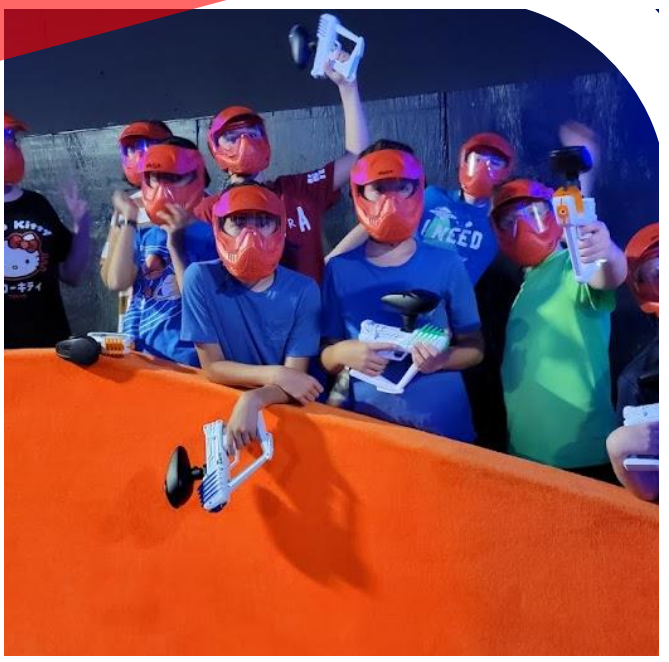
Actual PLAY Time Appx. 60 120mins