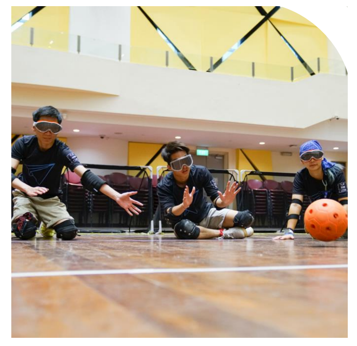
Demonstration & Tryouts Appx. 15 -20mins