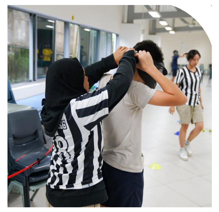
Demonstration & Tryouts Appx. 15 -20mins