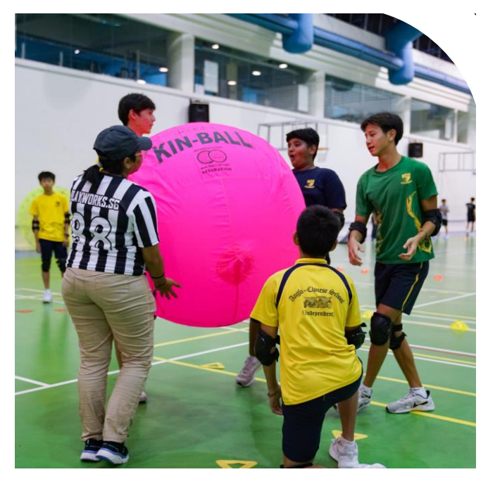
Demonstration & Tryouts Appx. 15 -20mins