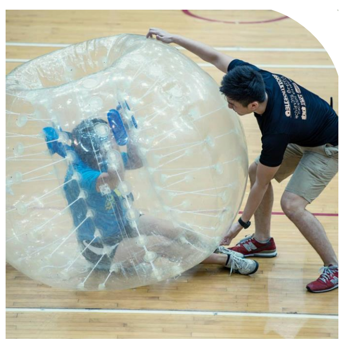
Demonstration & Tryouts Appx. 15 -20mins