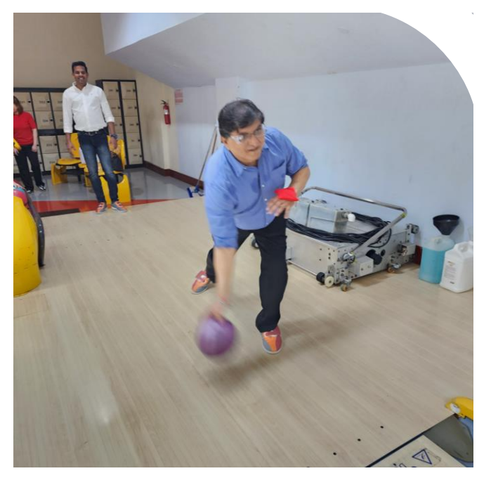
Demonstration & Tryouts Appx. 15 -20mins