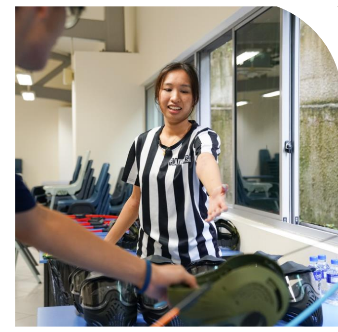
Safety Briefing & Warm-Up Appx. 15 - 20mins