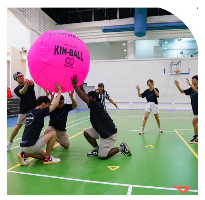
Actual PLAY Time Appx. 60 120mins