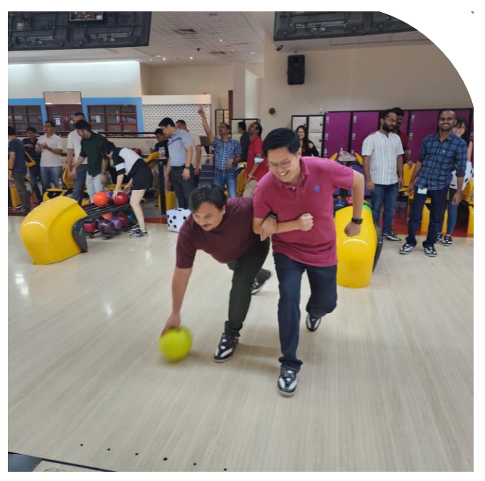
Actual PLAY Time Appx. 60 120mins