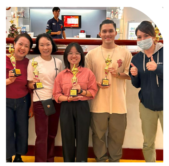
Award Presentation & Closing Appx. 15 – 20 mins