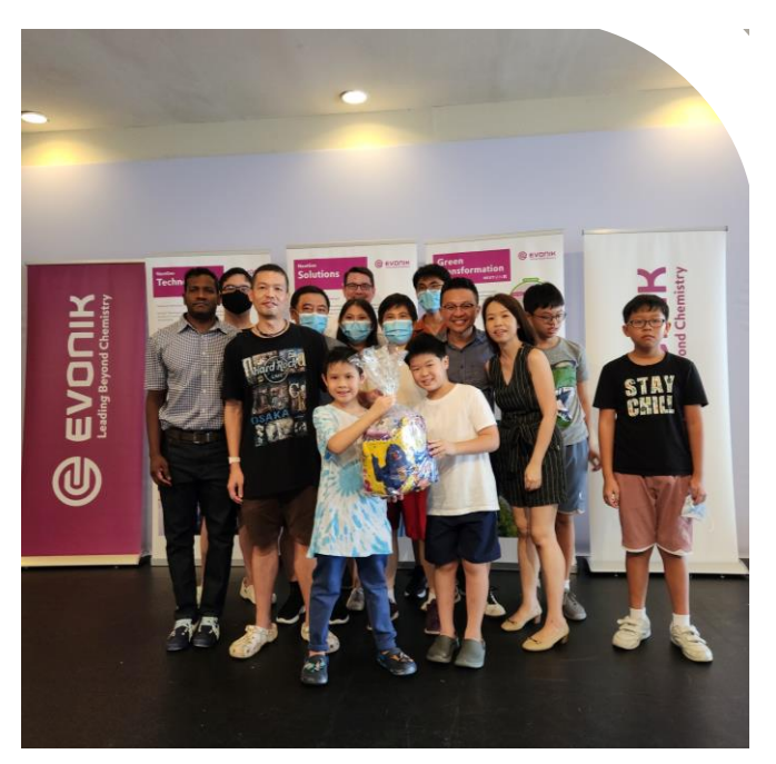
Award Presentation & Closing Appx. 15 – 20 mins