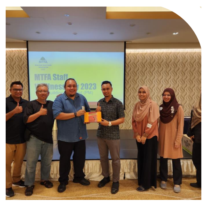
Award Presentation & Closing Appx. 15 – 20 mins