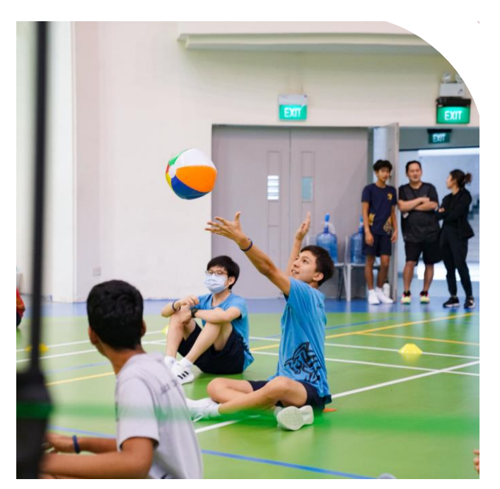
Actual PLAY Time Appx. 60 120mins