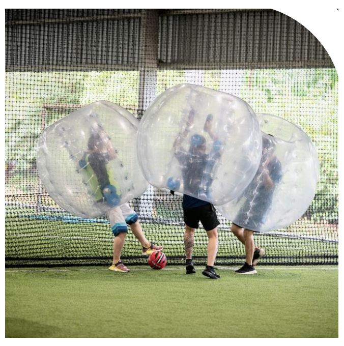
Actual PLAY Time Appx. 60 120mins