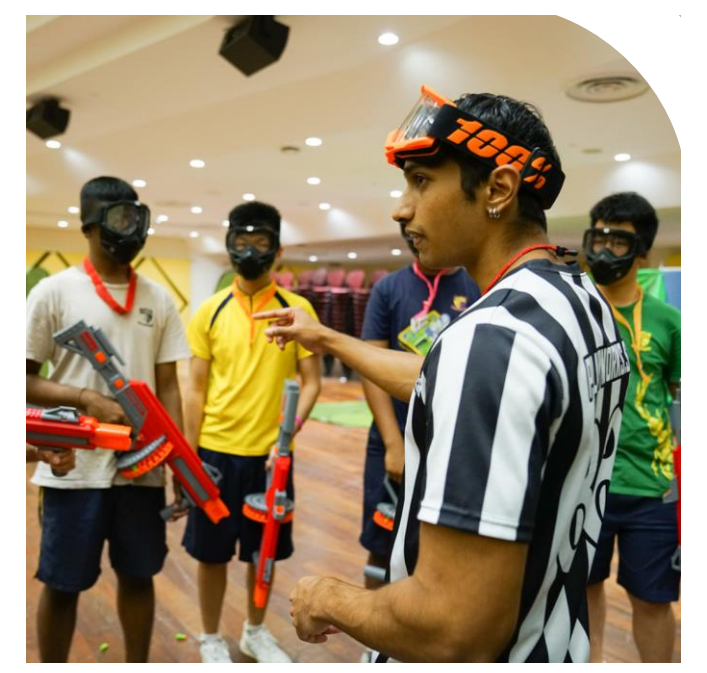
Safety Briefing & Warm-Up Appx. 15 - 20mins