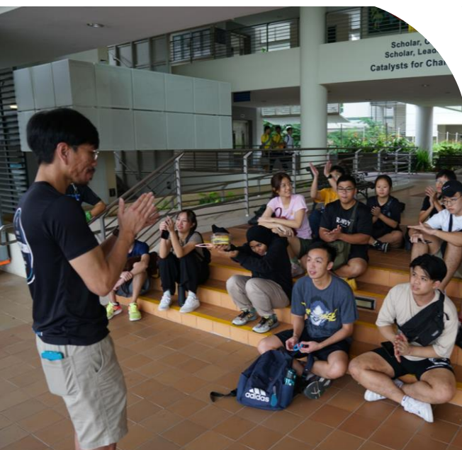
Safety Briefing & Warm-Up Appx. 15 - 20mins