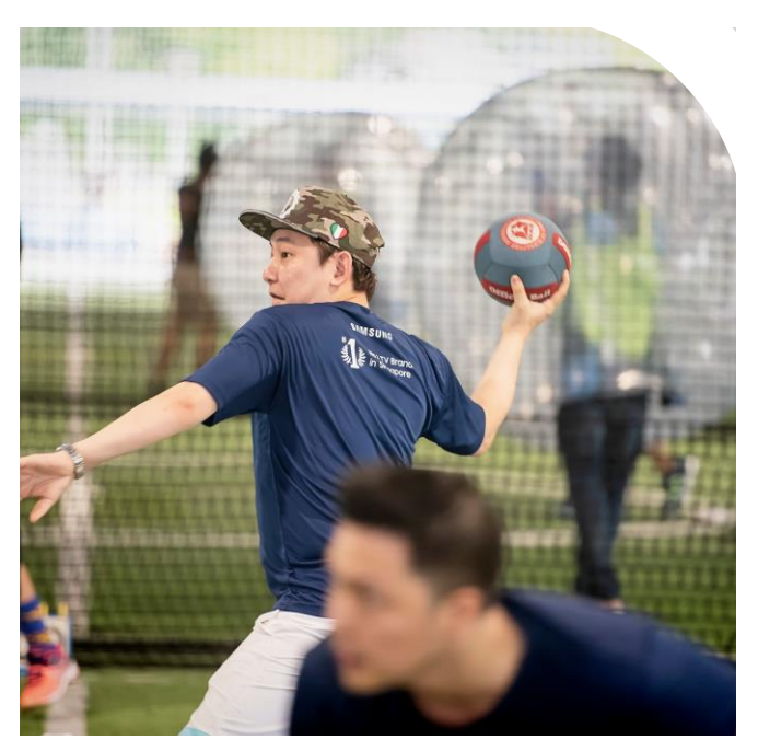
Actual PLAY Time Appx. 60 120mins