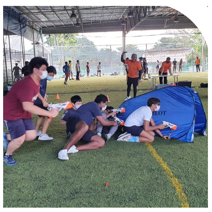
Actual PLAY Time Appx. 60 120mins