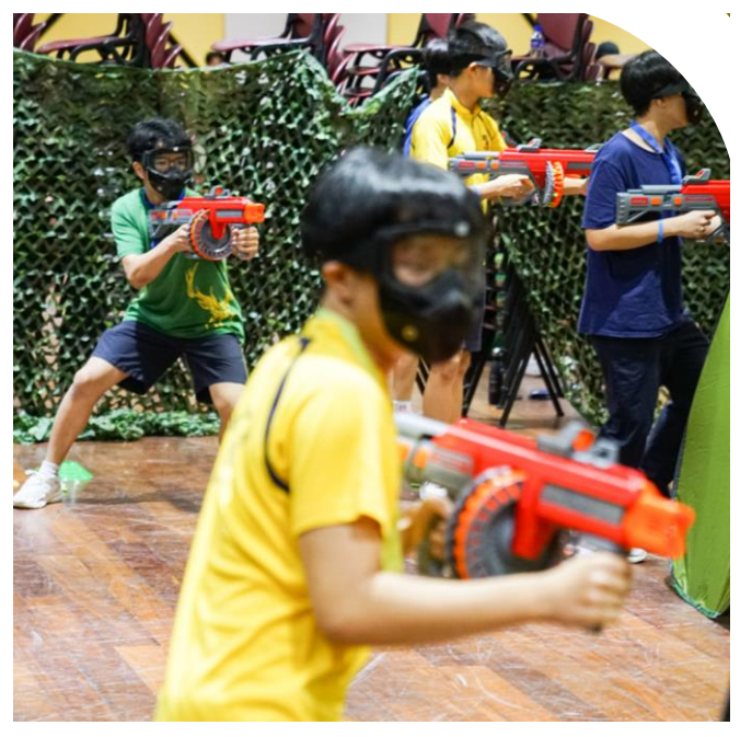
Actual PLAY Time Appx. 60 120mins