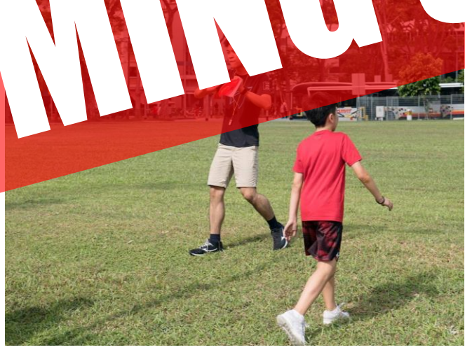
Safety Briefing & Warm-Up Appx. 15 - 20mins