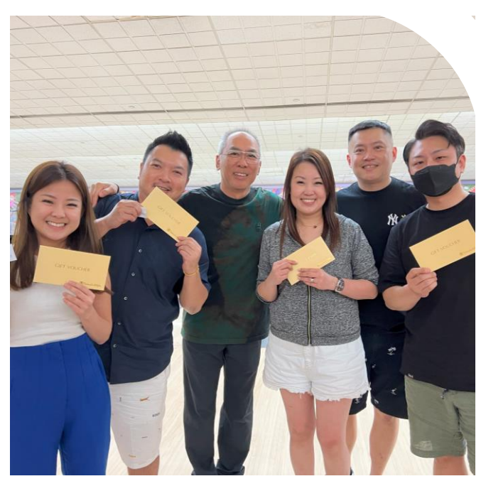
Award Presentation & Closing Appx. 15 – 20 mins