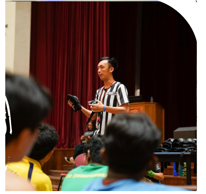
Safety Briefing & Warm-Up Appx. 15 - 20mins