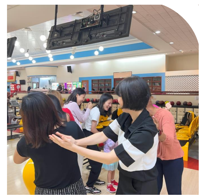
Safety Briefing & Warm-Up Appx. 15 - 20mins