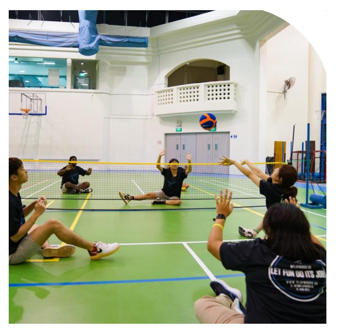
Demonstration & Tryouts Appx. 15 -20mins

Services Include: All Equipment & Prop Rental, Facilitation & Umpiring of games, First Aid & Sanitizing Stations.