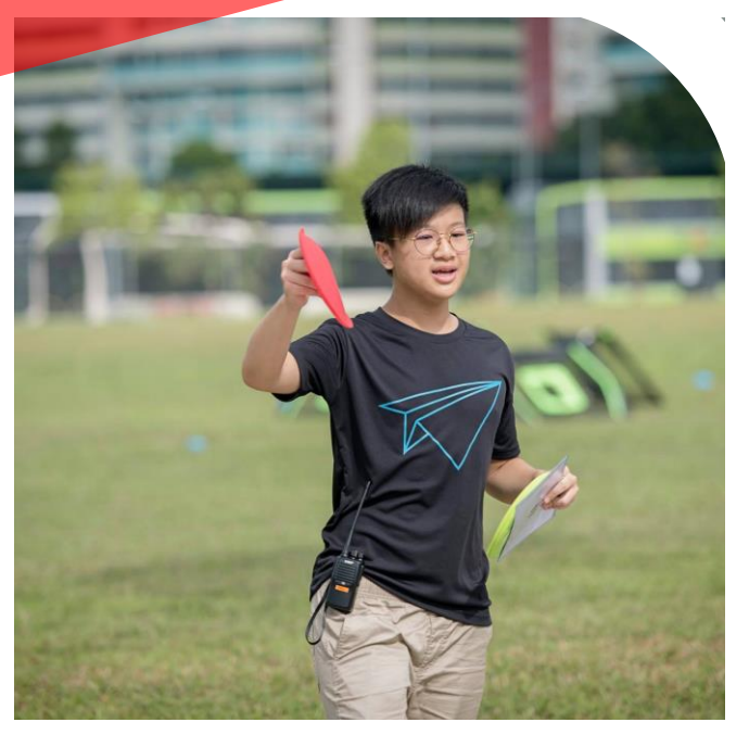
Actual PLAY Time Appx. 60 120mins