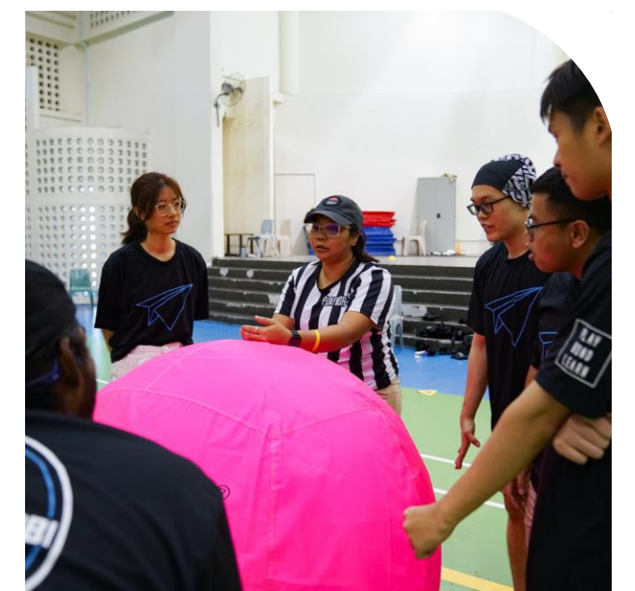
Safety Briefing & Warm-Up Appx. 15 - 20mins