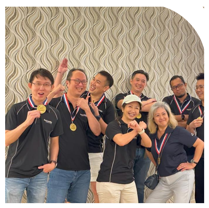
Award Presentation & Closing Appx. 15 – 20 mins