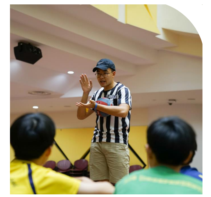
Safety Briefing & Warm-Up Appx. 15 - 20mins