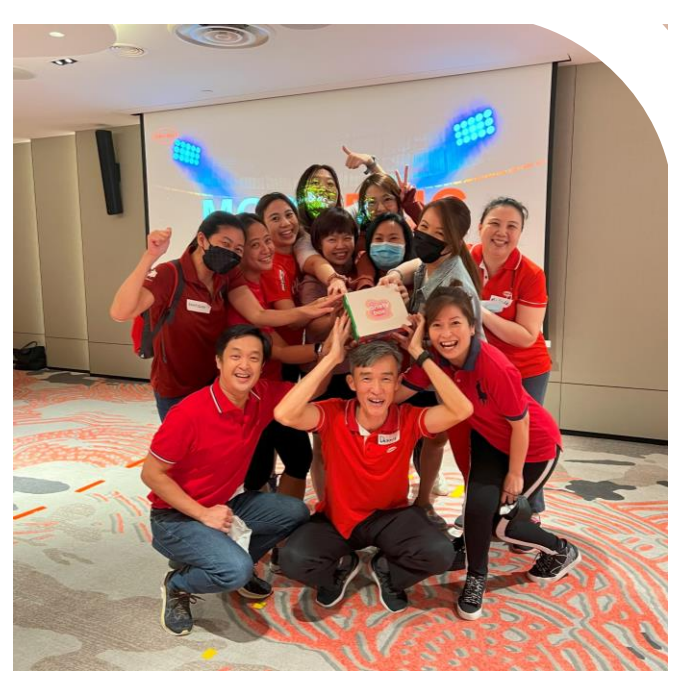
Award Presentation & Closing Appx. 15 – 20 mins