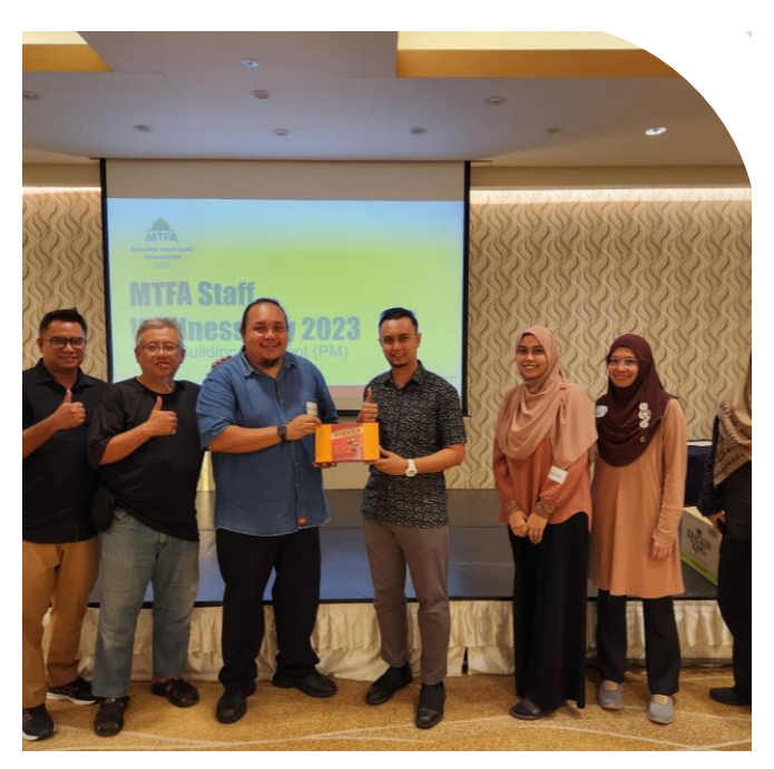
Award Presentation & Closing Appx. 15 – 20 mins