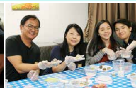
Members trying their hand at making mooncakes.