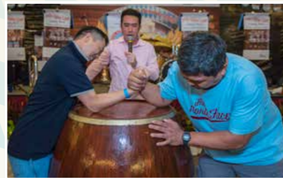
The classic arm-wrestling competition!

Golfers, social members and guests revelled in fun and laughter with family and friends as they celebrated all things German, while enjoying European country music by live band Swiss Alpine Lions, refreshing beer and a spread of hearty fare.