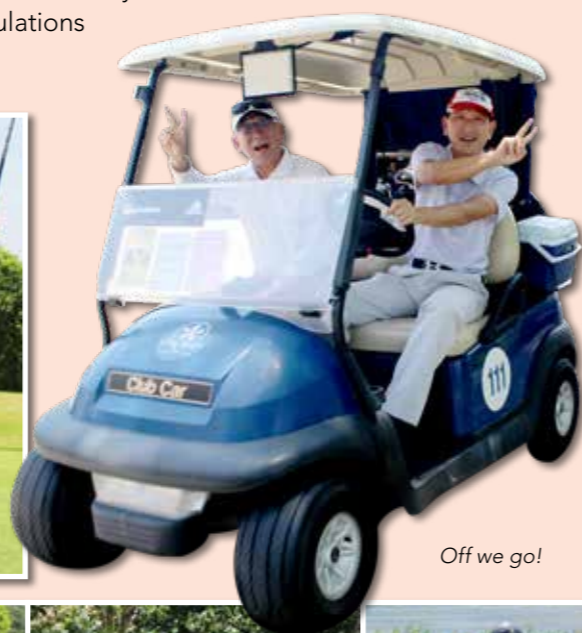
Off we go!