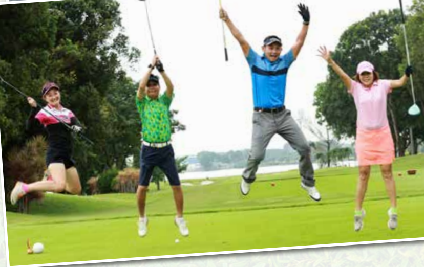
Golf courses teeming with energy and life as ecstatic golfers teed off.