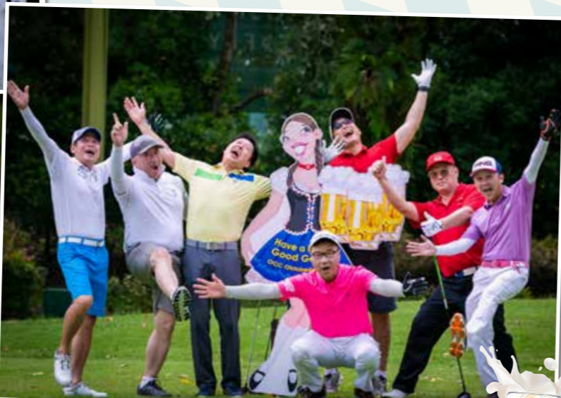
What's Oktoberfest without some "beer" on the golf course?