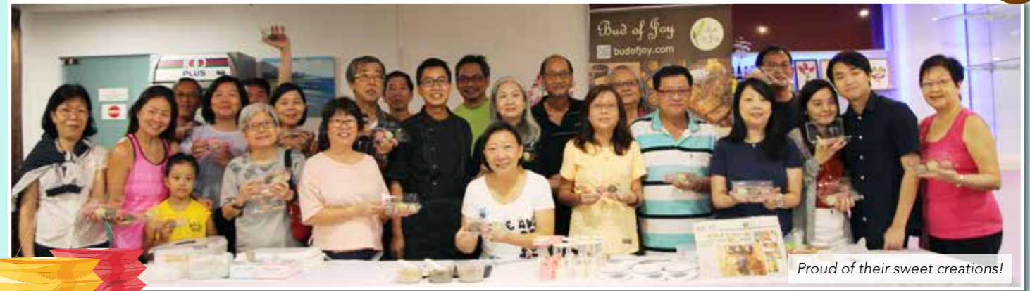
Proud of their sweet creations!