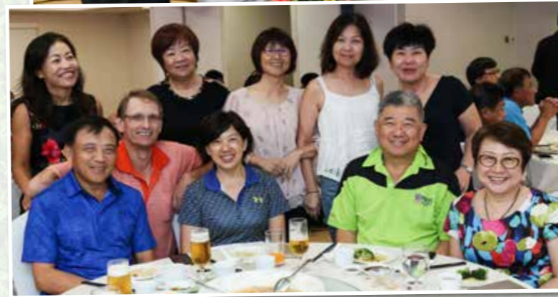
Everyone having a blast at the dinner!