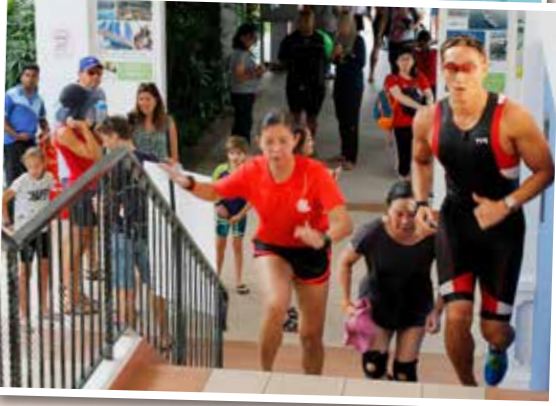
Participants racing while families and friends cheered.