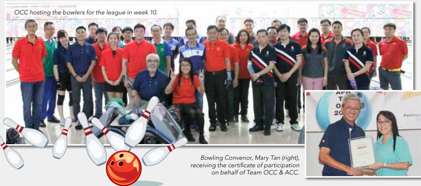
OCC hosting the bowlers for the league in week 10.