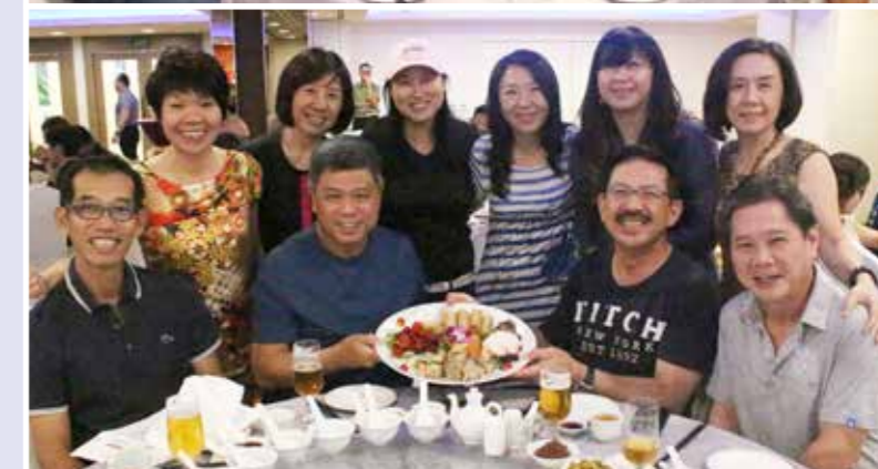
A hearty dinner to end the night!