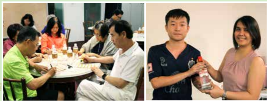
Members engrossed in the game.