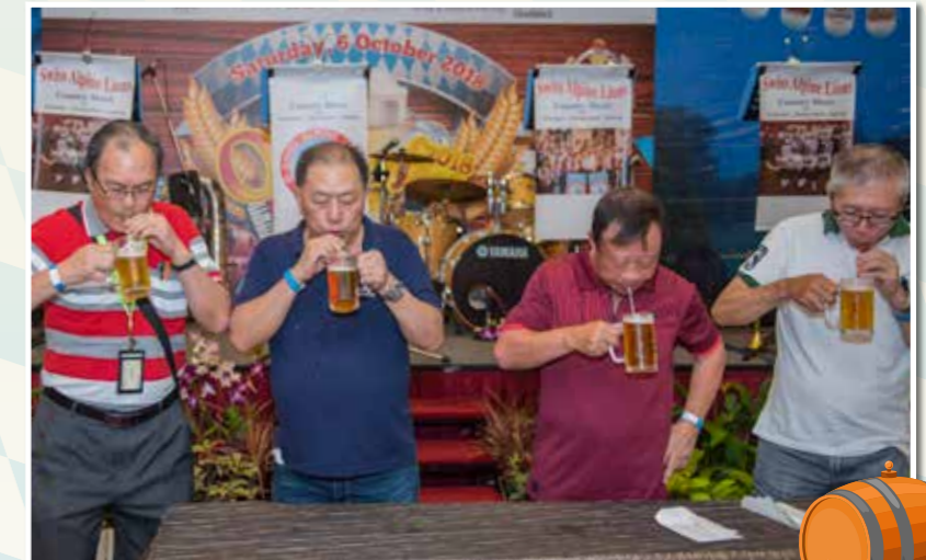
Participants showing their prowess as they took swigs of beer in the beer drinking contest.

The line-up of stage games such as sausage eating competition and arm wrestling got the participants into the festive mood. The night ended on an all-high with the lively prize presentation!