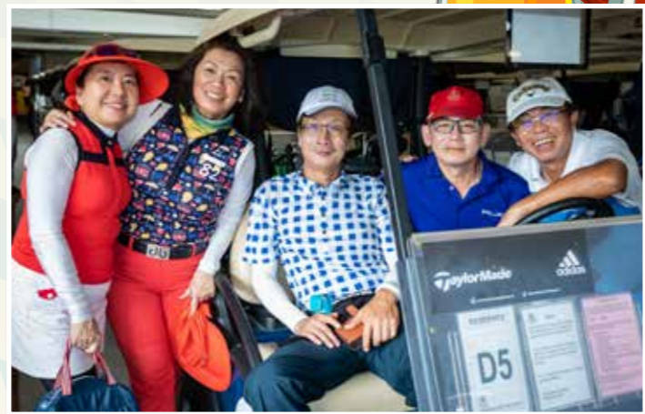
Excited golfers before the game starts.