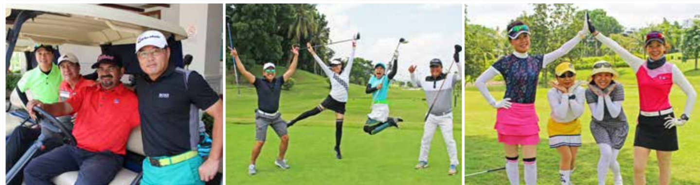
Ready to tee off in high spirits!