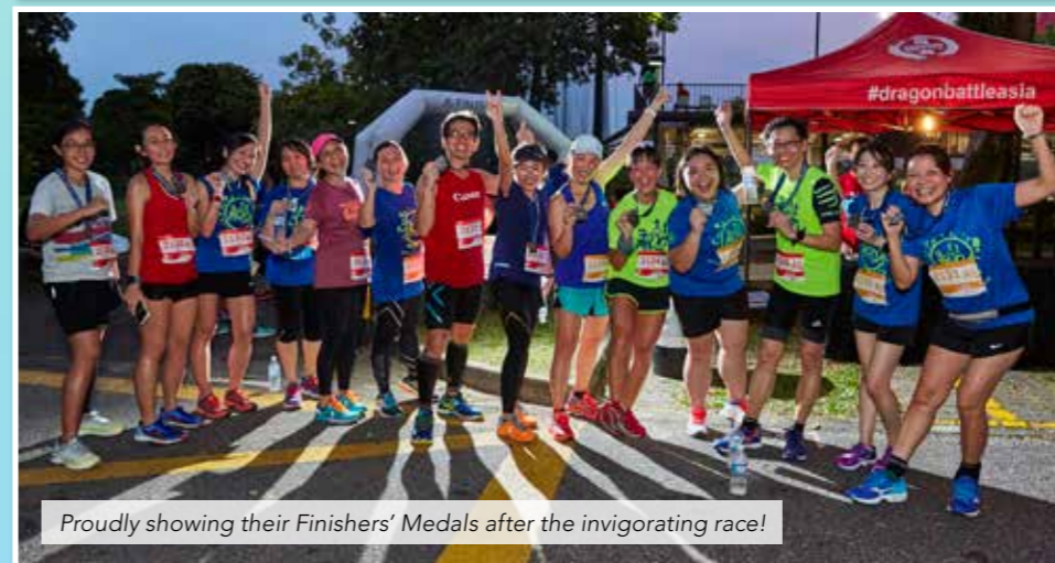
Proudly showing their Finishers' Medals after the invigorating race!