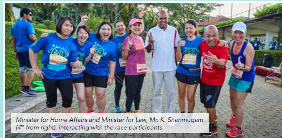
Minister for Home Affairs and Minister for Law, Mr. K. Shanmugam (4 th from right), interacting with the race participants.