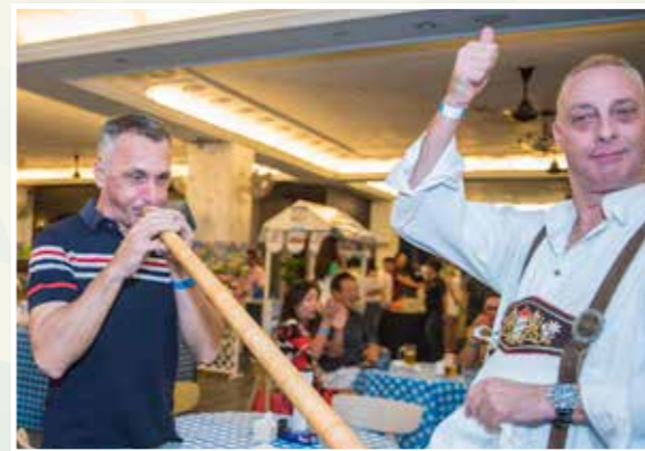
Trying out the alphorn.