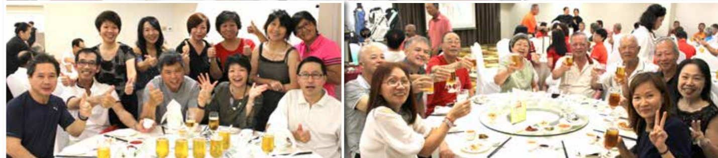
Enjoying a light-hearted dinner and toasting to a game well played.