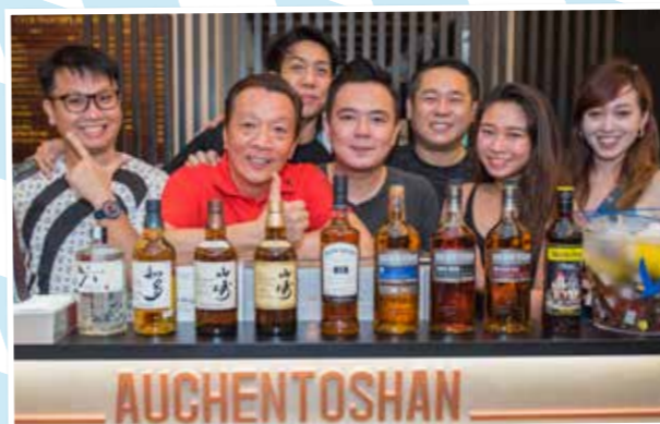
Special thanks to the sponsors of the night!