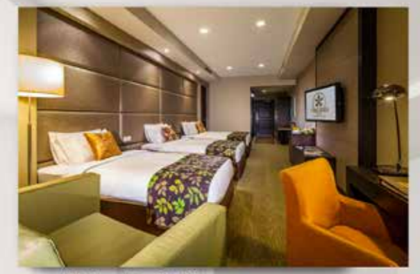
▲Deluxe Family Room

Enjoy 30 days stay in our Deluxe Room at S$4,000nett* and Deluxe Family Room at S$5,000nett* only.