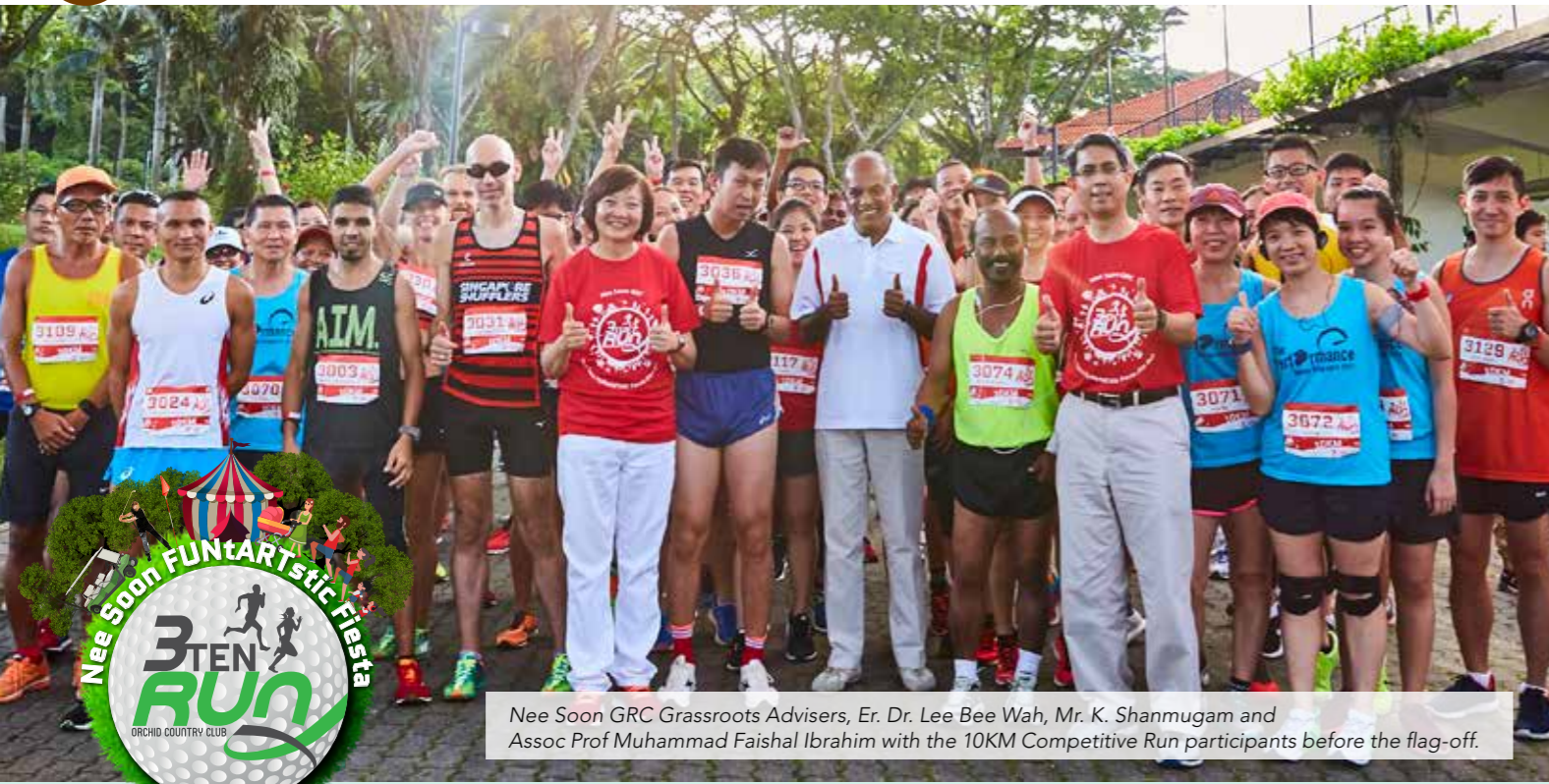
Nee Soon GRC Grassroots Advisers, Er. Dr. Lee Bee Wah, Mr. K. Shanmugam and Assoc Prof Muhammad Faishal Ibrahim with the 10KM Competitive Run participants before the flag-off.