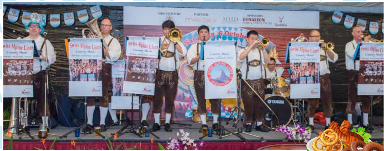
The Swiss Alpine Lions playing groovy and upbeat music for the night.