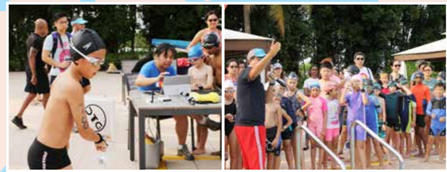
All eager to start the race!