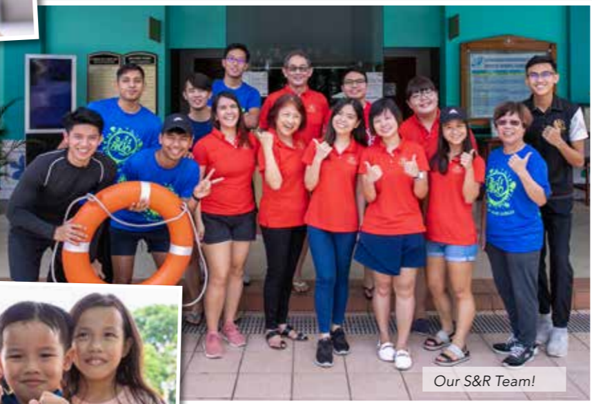
Our S&R Team!