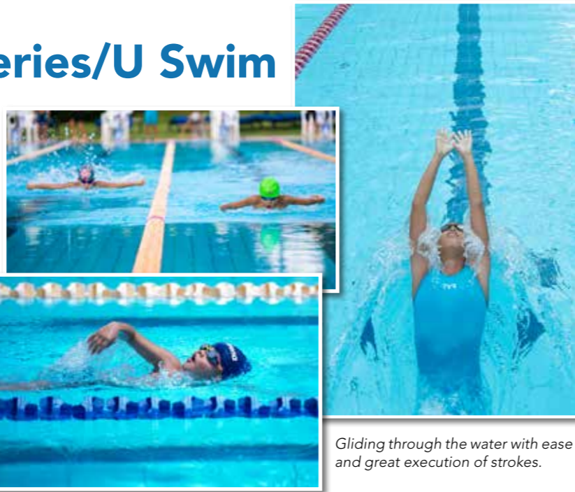
Gliding through the water with ease and great execution of strokes.

Held in conjunction with U Swim by U Sports, 86 swimmers from across 15 Unions and 5 Corporates also joined in the exciting challenge and competed in the 200m Breaststroke and Freestyle relay. There was immense excitement as supporters cheered energetically and everyone had a whale of a time!