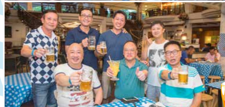
Cheers to building strong camaraderie and breaking barriers over drinks.