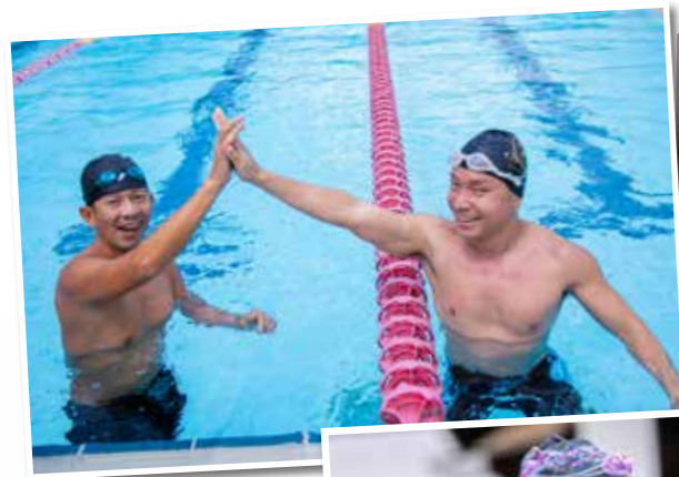
Supporting and cheering each other on.