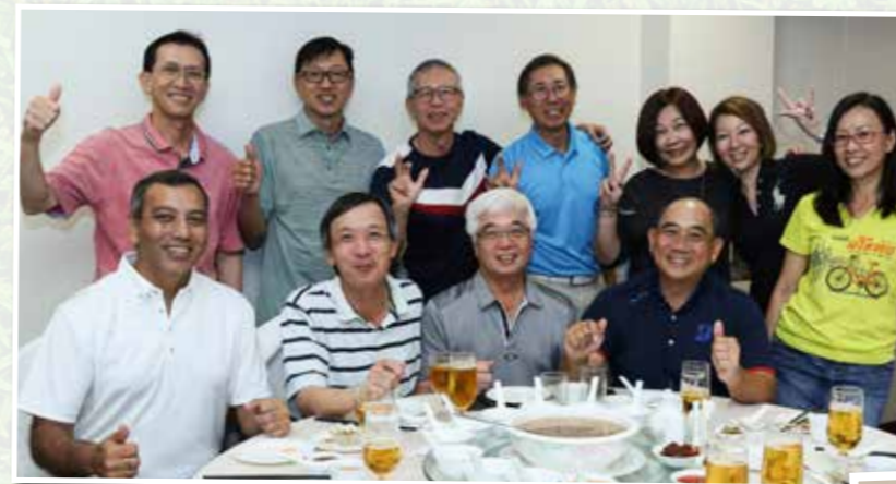
Cheers to our new members from RCC!