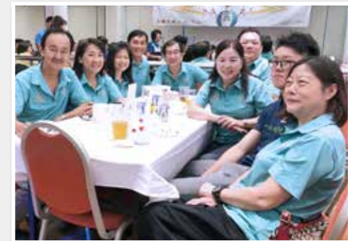
Team OCC & ACC bowlers having a good time at the Victory Dinner.

Strikes, spares and splits were observed with anticipation at the 24 th Adult Inter-Club Bowling Mixed League, with matches among the eight Clubs held from April to October this year. In spite of the intense competition, our 16-member strong bowling team from OCC & ACC managed to finish off the 24 weeks long league with a total pinfall of 49,817. The league concluded with a Masters Event and Victory Dinner hosted by Chinese Swimming Club, where all bowlers celebrated over dinner, performances and prize presentation. Once again, well done to all bowlers!