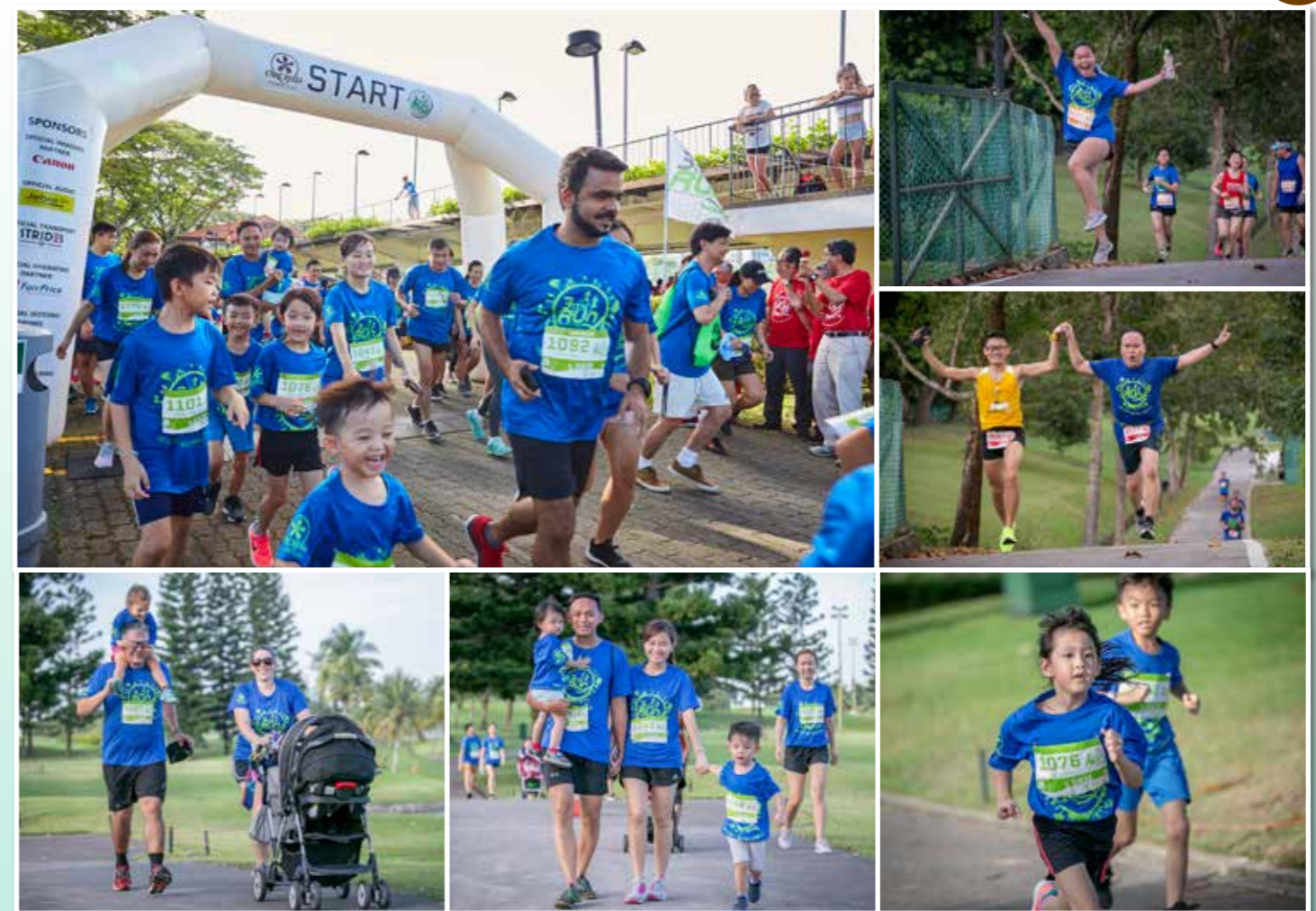
A great evening run along the lush golf courses of OCC for participants and their families.